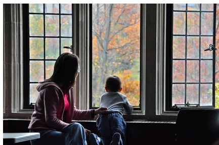
Illustration: Peter Burke, taken from The National Geographic page

tinytowntimes.com archival image, Oct. 26, 2010.